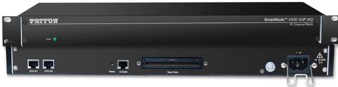
Figure 1. SmartNode 4400

This Quick Start Guide leads you through the basic steps to set up a new SmartNode (see figure 1 ) and to download a configuration. Please note that this guide does not replace the detailed Software Configuration Guide and the Getting Started Guide on the CD-ROM and available online at www.patton.com/voip .