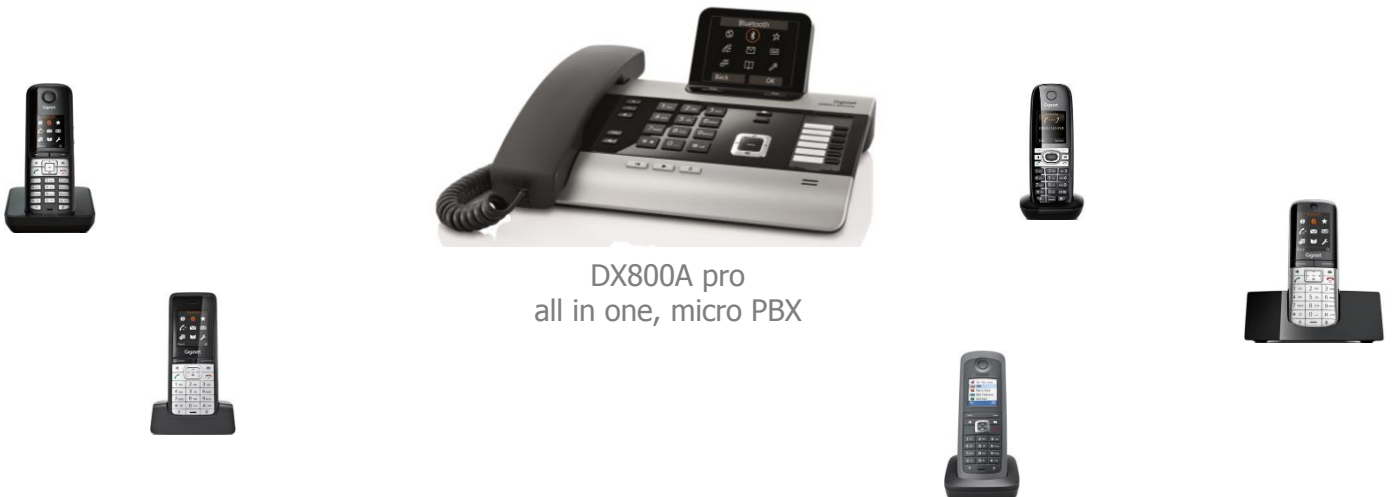
DX800A pro all in one, micro PBX