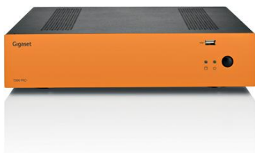
T300 pro mini PBX