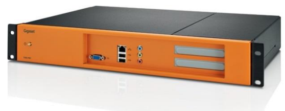
T500 pro large PBX

Multiple sites can be seamlessly inter-connected with a common numbering scheme