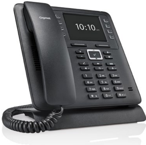
Main device with wired handset article number: S30853-H4008-R101