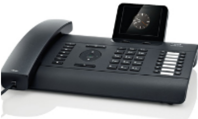
DE700 IP PRO