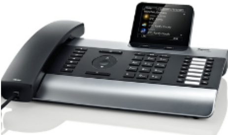
DE900 IP PRO

A special module is made that download the files automatically from our Gigaset server and places the new files on the PBX, click here .